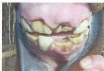
Incisors of a yearling.