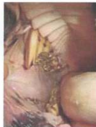
Severe hook on the upper premolar.

Don't wait until your horse is having major problems with their mouth, call and schedule an appointment today (320) 679-8245.