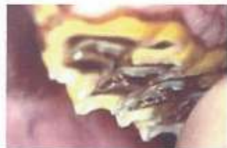
Sharp enamel points on the outside of the upper molars.

Not all horses will exhibit signs that they have an issue in their mouth or with their teeth which is why dental exams are so very important. However, if your horse is bothered by their mouth or teeth, they may drop hay or grain, turn their head to the side when they eat, or even exhibit problems when riding.